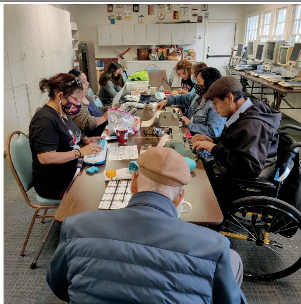
July 13 Braille Class

As we celebrate our fiftieth anniversary of The Blind and Visually Impaired Center of Monterey County, much has happened since the Center's incorporation on August 13, 1971. After almost 16-months since local, State and National Shelter-in-Place Orders were issued, the Board of Directors and I are pleased to welcome back our regular activities at the Center. On July 6, 2021, the peer-led support group and luncheon resumed at our Pacific Grove location. We had 12 members in attendance. Braille classes resumed with eight members in attendance. We are also excited to announce that the mobile low vision clinic will begin this fall and be placed throughout Salinas and South County on a consistent schedule.