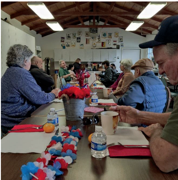
July 6 Support Group

The Blind and Visually Impaired Center of Monterey County is pleased to announce that the peer-led support group resumed in-office meetings on Tuesday, July 6, 2021. The support group was well attended, with 12 attendees. At the conclusion of the support group, lunch was provided to all in attendance. The support group meets the first and third Tuesdays of each month at 10:00 AM at the Pacific Grove office, located at 225 Laurel Avenue.